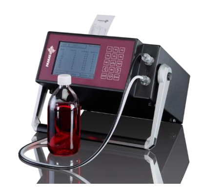
Figure 2: Device for particle determination by means of laser

In the determination with a laser, a laser beam is sent through the flowing sample. The laser beam illuminates the sample material flowing through the measuring cell, and a measuring sensor behind the measuring cell behind the measuring cell then detects the laser light diffracted or scattered by the particles with angular resolution.